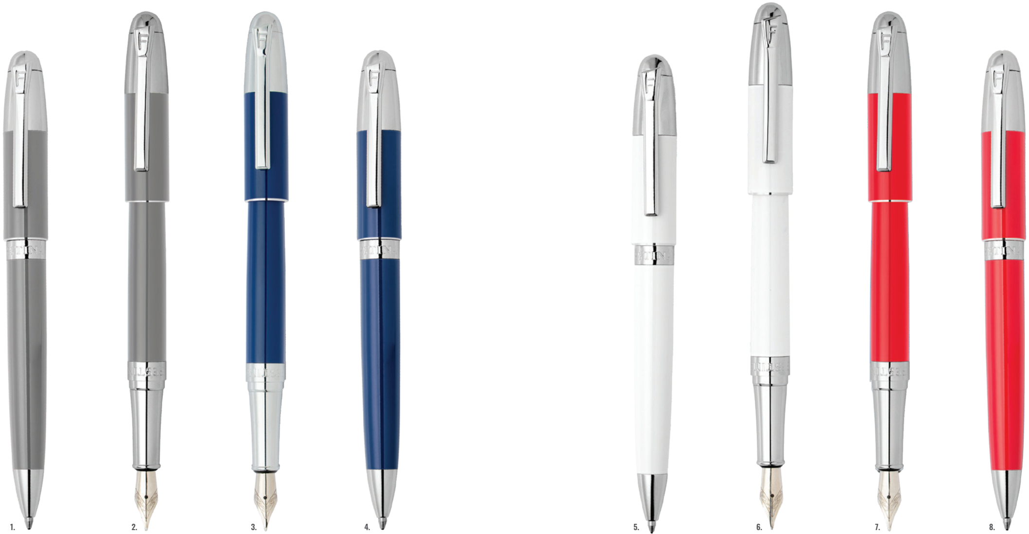
1. FSN1964H Classicals Chrome Grey Ballpoint pen