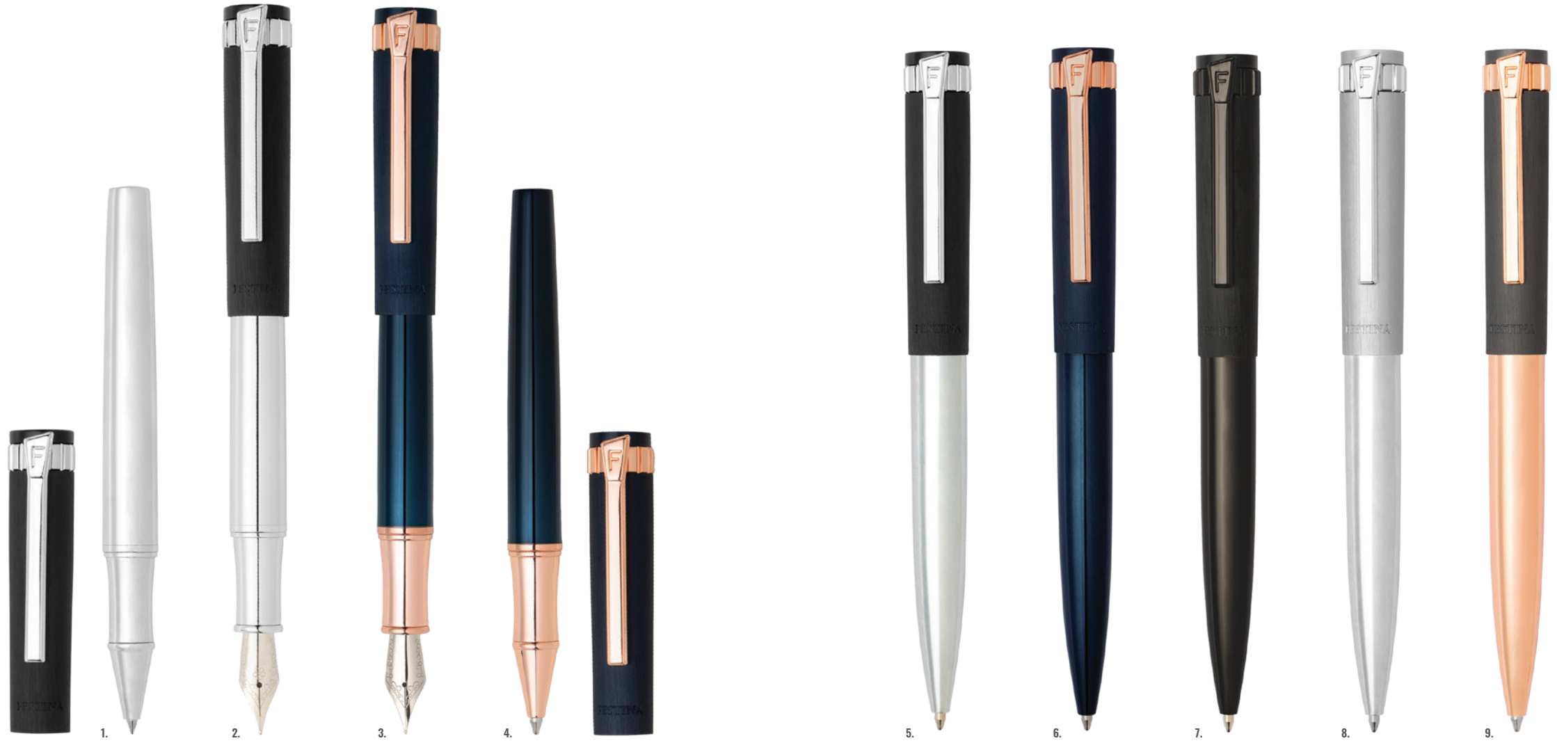
1. FSR1545A Prestige Chrome Black Rollerball pen