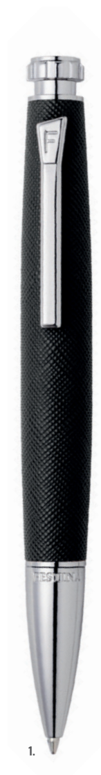
1. FSU3234A Chronobike Black Ballpoint pen