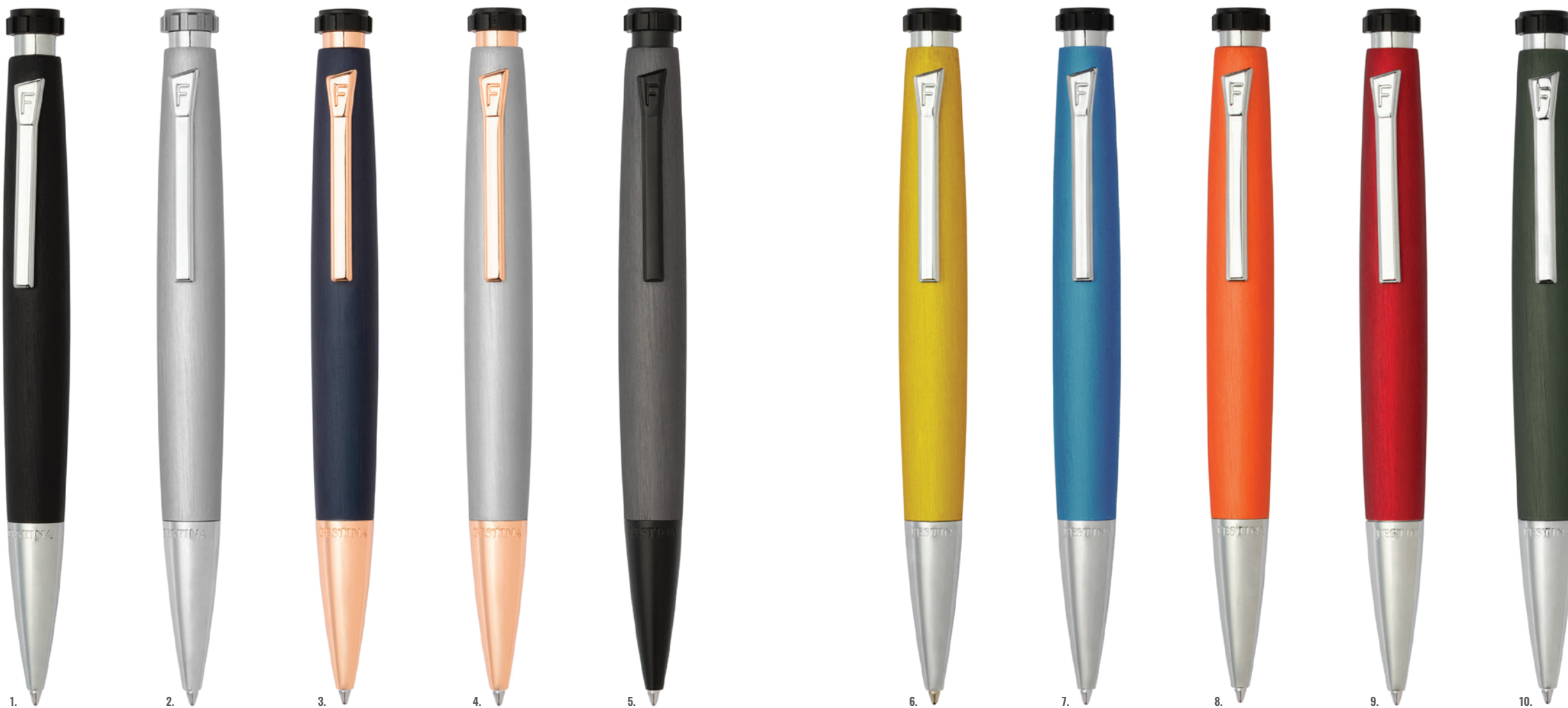
1. FSC1414A Chronobike Classic Chrome Black Ballpoint pen