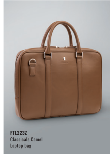
FTL223Z Classicals Camel Laptop bag