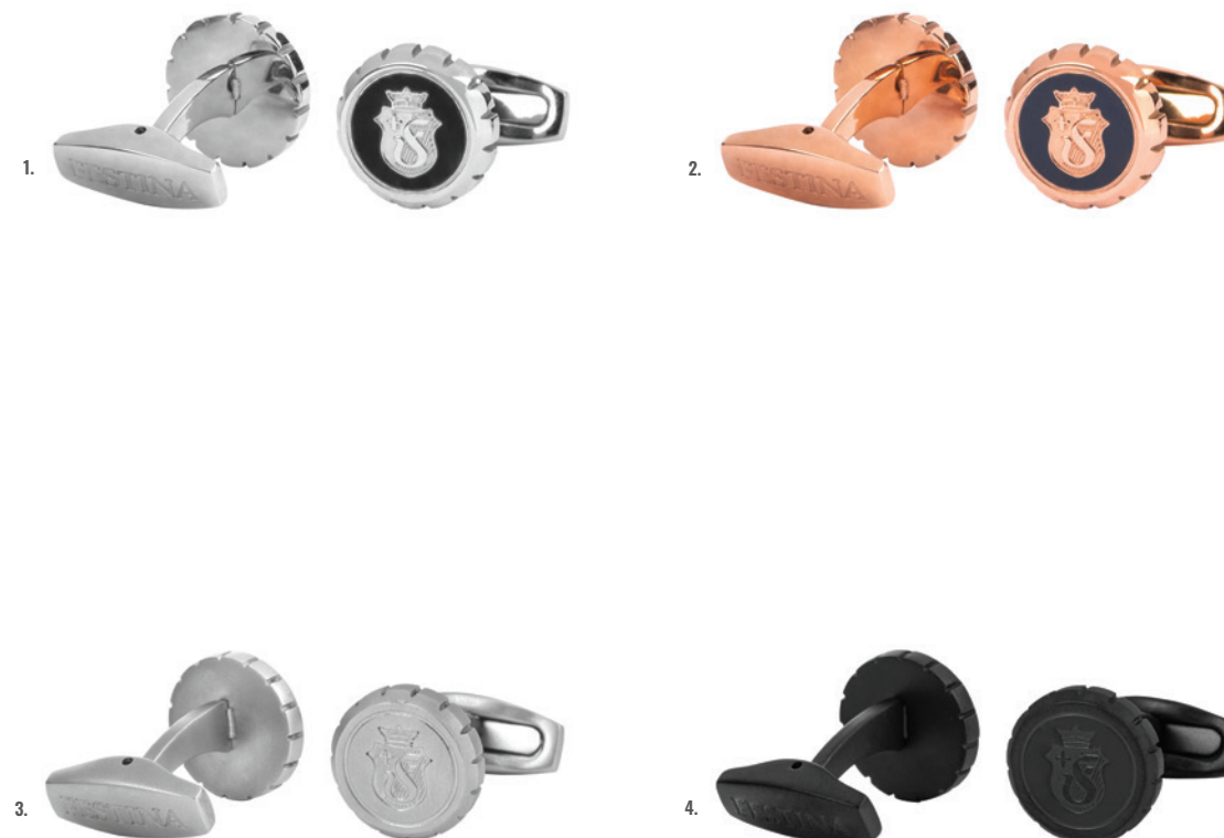
1. FJM221C Chronobike Black & Silver Cufflinks