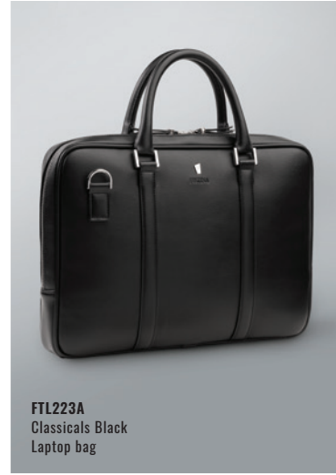
FTL223A Classicals Black Laptop bag