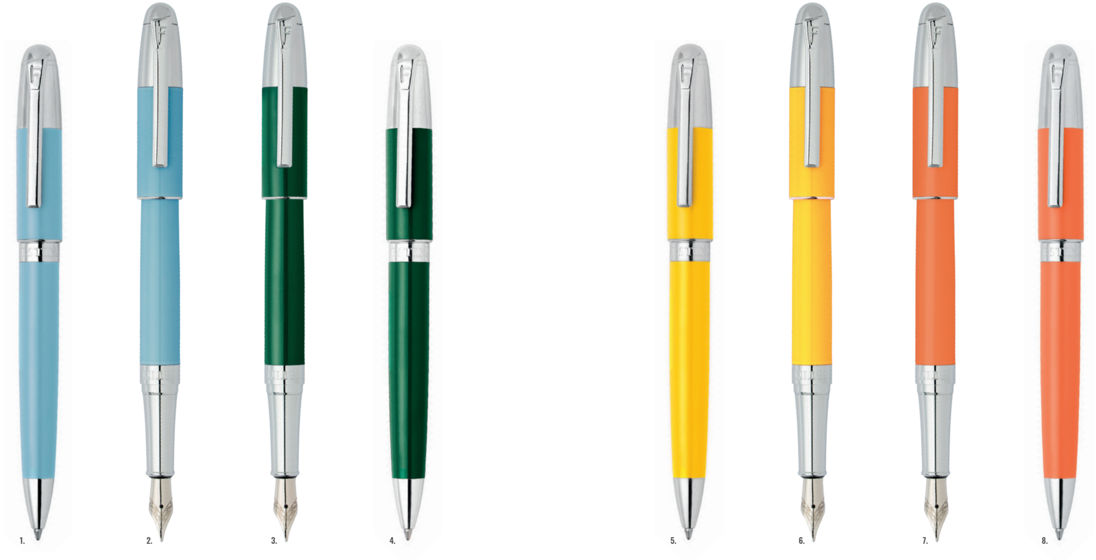
1. FSN3874M Classicals Chrome Light Blue Ballpoint pen