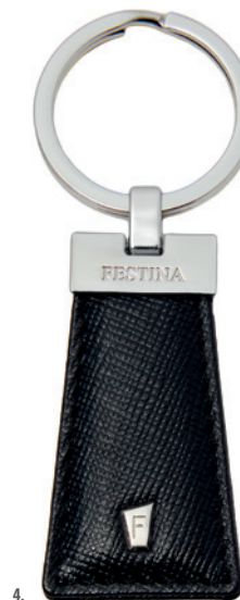
4. FAK323A Chronobike Black Key ring