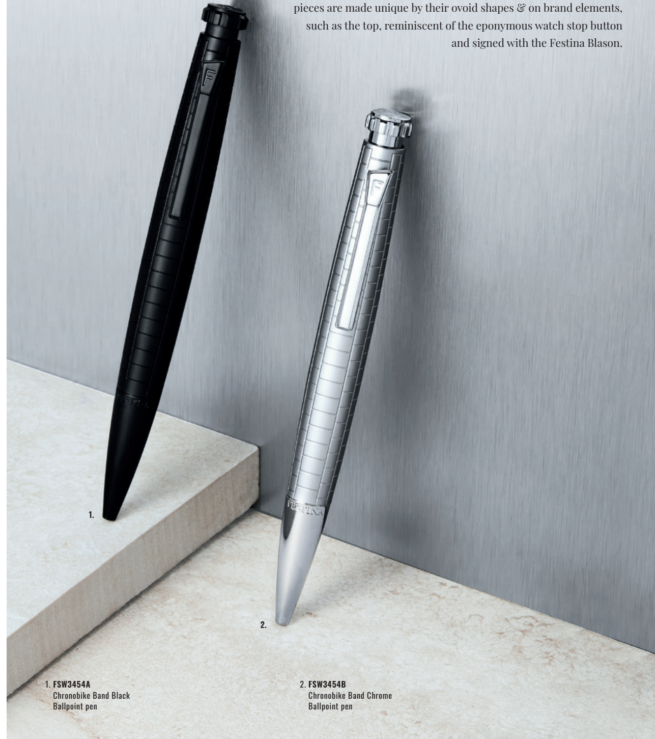
1. FSW3454A Chronobike Band Black Ballpoint pen

Now offered in an array of 3 different textures, the Chronobike writing pieces are made unique by their ovoid shapes & on brand elements, such as the top, reminiscent of the eponymous watch stop button and signed with the Festina Blason.