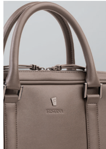
FTL223H Classicals Grey Laptop bag