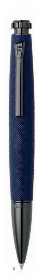
3. FSU3234N Chronobike Navy Ballpoint pen