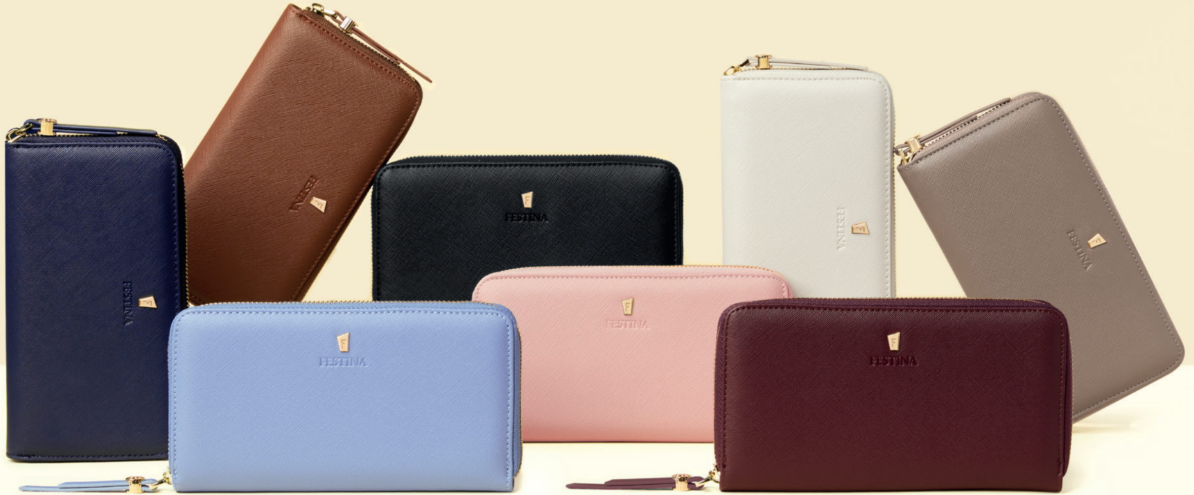
FEL222A Mademoiselle Black Travel wallet