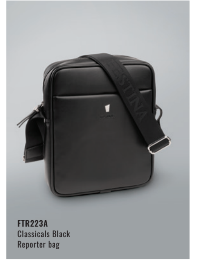
FTR223A Classicals Black Reporter bag