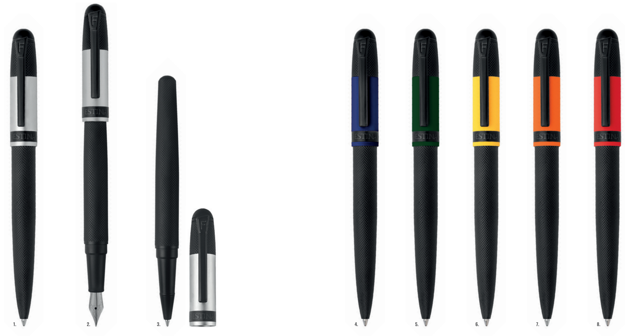
1. FSW3984C Classicals Black Edition Silver Ballpoint pen