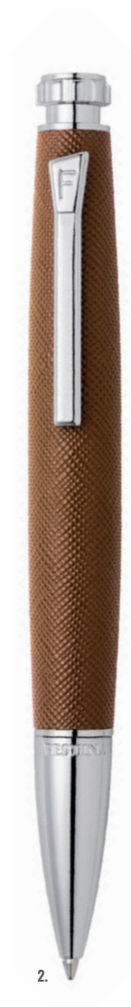
2. FSU3234Z Chronobike Camel Ballpoint pen