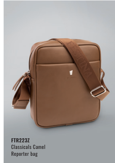
FTR223Z Classicals Camel Reporter bag