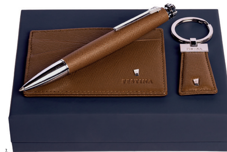
7. FPBCK323Z Set Chronobike key ring & Chronobike card holder & Chronobike ballpoint pen