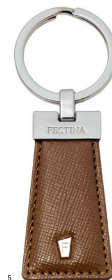
5. FAK323Z Chronobike Camel Key ring