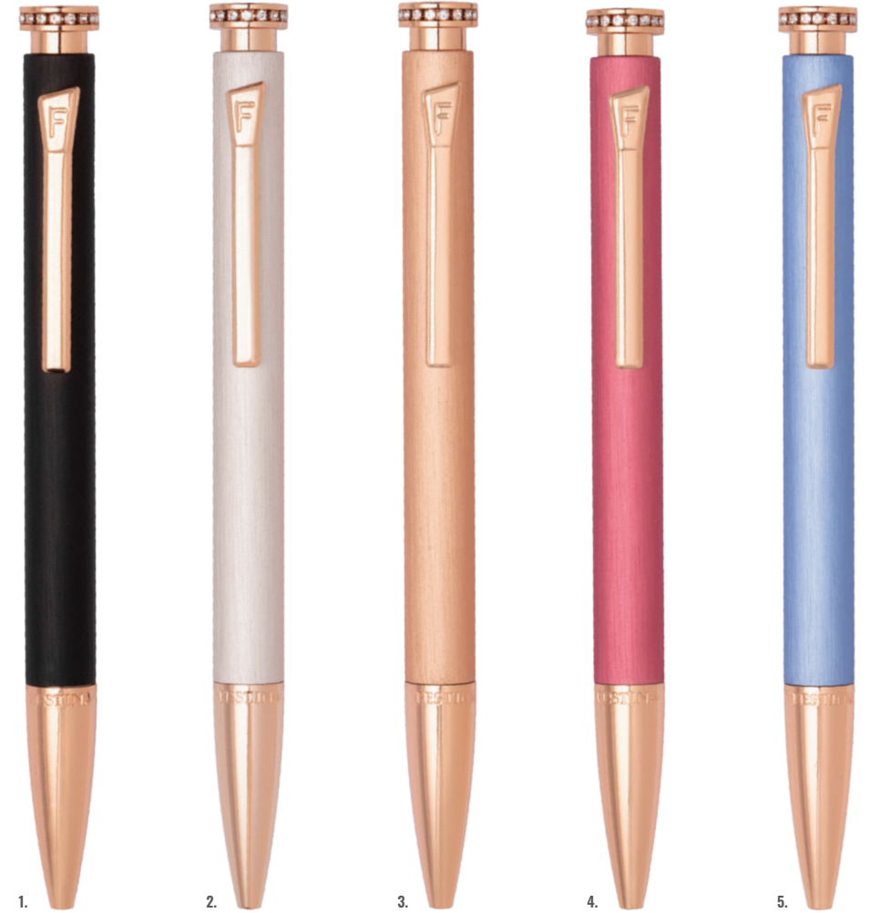
1. FSC2224A Mademoiselle Black Ballpoint pen