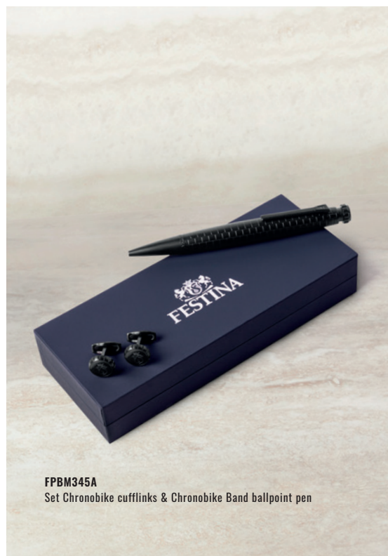
FPBM345A Set Chronobike cufflinks & Chronobike Band ballpoint pen